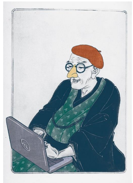
Shiriagari Kotobuki