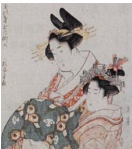
Katsushika Hokusai "Courtesan and Her Young Attendant" (a part of the picture) ※Work will be displayed