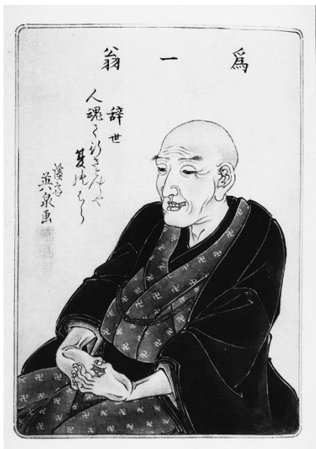
Keisai Eisen "Hokusai Portrait"