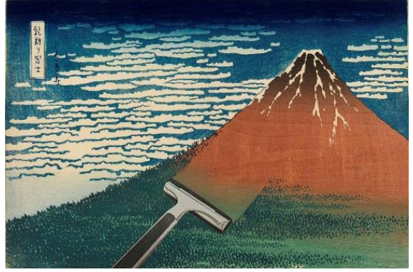
Shiriagari Kotobuki "Higesori Fuji"