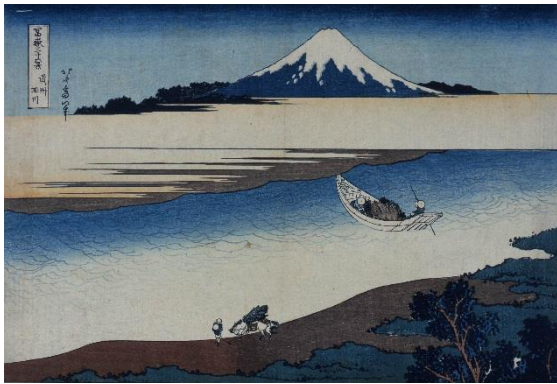
Katsushika Hokusai "Tamagawa River in Musashi Province, Thirty-six Views of Mount Fuji "Collection: the Sumida Hokusai Museum