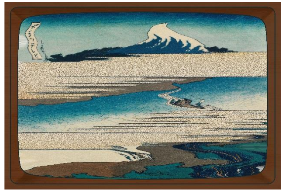
Shiriagari Kotobuki "Ponkotsu TV" ©SHIRIAGARI kotobuki