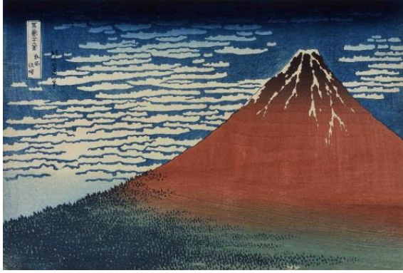
Katsushika Hokusai "A Mild Breeze on a Fine Day, Thirty-six Views of Mount Fuji "Collection: the Sumida Hokusai Museum